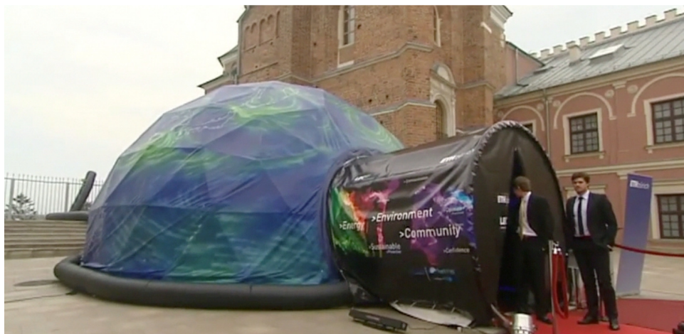
Figure 1. Visualisation dome exterior