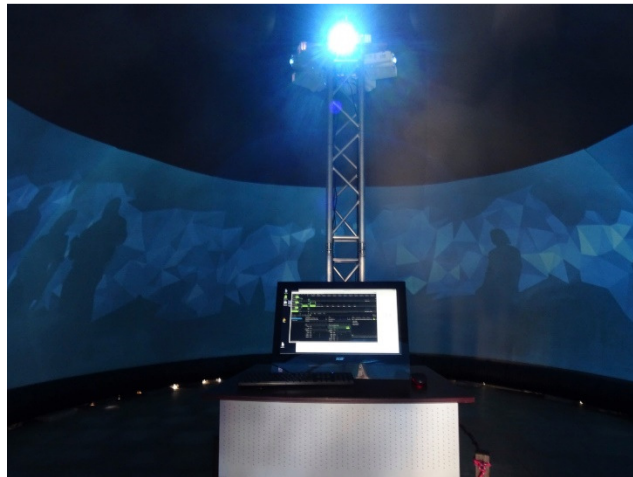
Figure 2. Visualisation Dome interior