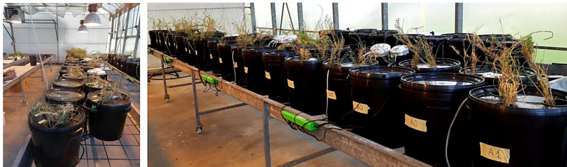
Figure 1. Picture of the experimentation in mesocosm carried out in the greenhouse

The test involved the installation of 12 hydroponic systems, which consisted of three pots of 28 L each (36 cm diameter and 38 cm height), connected by plastic tubes. Two pots of the hydroponic system were dedicated to plant cultivation. The third pot was equipped with mechanical pumps to ensure the circulation of the solution in all three pots. An air pump was connected with a tube, and an air stone lay at each pot's bottom to ensure aeration. This hydroponic system guarantees the best-growing conditions for the plants for a long-lasting experiment, avoiding the repeated change of the nutrient solution but allowing fertiliser addition when necessary.